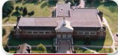
Homer Health & Recreation Center