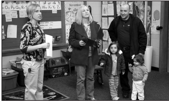
Potential parents tour St. Anthony during Open House.

The Enrollment Committee at St. Anthony School has traditionally hosted an Open House in the winter as a way to showcase the school for prospective school families. For the past two years, the winter event has been followed by an informal, smaller scale Open House in May. For the first time, a fall Open House was also added to the calendar in November. These dates provide both weekend and weekday times to accommodate different schedules.