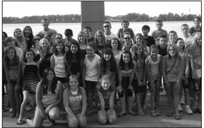
St. Anthony youth gathered for the annual Belle of Louisville Cruise on June 14.

Many of our youth also volunteered each Thursday throughout the summer to help serve food at the Franciscan Shelterhouse.