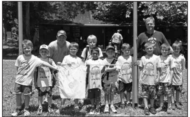
Above: Pack 48 went to Tunnel Mill Scout Camp the week of June 14 to 18 for an exciting week of Day Camp. The pack had a record 27 Scouts attend the event whose theme was the one hundredth anniversary of scouting. Scouts enjoyed activities like bow and arrow, BB shooting, nature programs and swimming. Pictured here are the pack's younger Scouts and their leaders organized into the Lion Patrol.