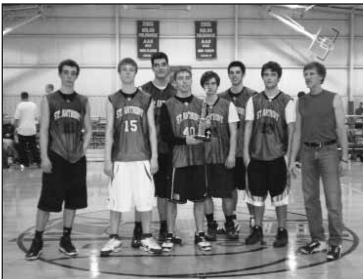
CYO boys' basketball team won the championships this past school year.